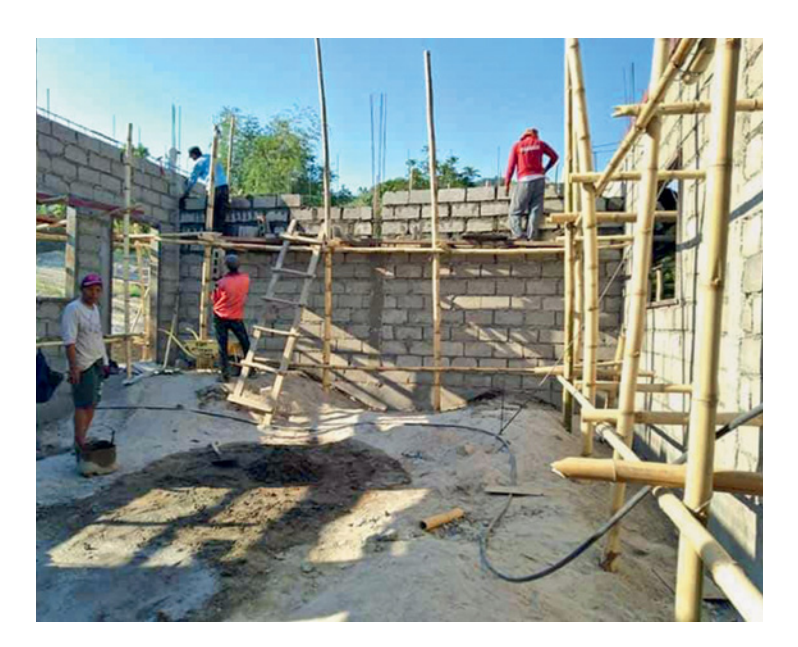
This building is going up with funds from NAC SEA Relief Fund (NAC South-East Asia)