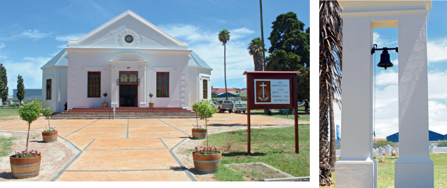
The church building was dedicated in 1820 by the Dutch Reformed Church, was declared as a provincial cultural heritage site in 2000, and has been used by the New Apostolic Church since 2014

In 2014 the congregation in Somerset in Cape Town (South Africa) moved into a different place of worship. The congregation's new home is an old Dutch Reformed Church that was taken over by the New Apostolic Church and renovated. The building is over 200 years old.