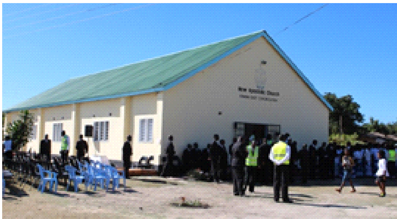
Kawama East congregation, dedicated on May 25, 2017.