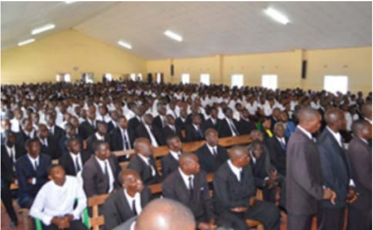
Part of the congregation that participated in a divine service conducted by District Apostle Charles Ndandula at Sesheke Central Congregation on May 6, 2017

1840 members participated in a divine service conducted by District Apostle Charles S. Ndandula at Sesheke Central Congregation in Sesheke.