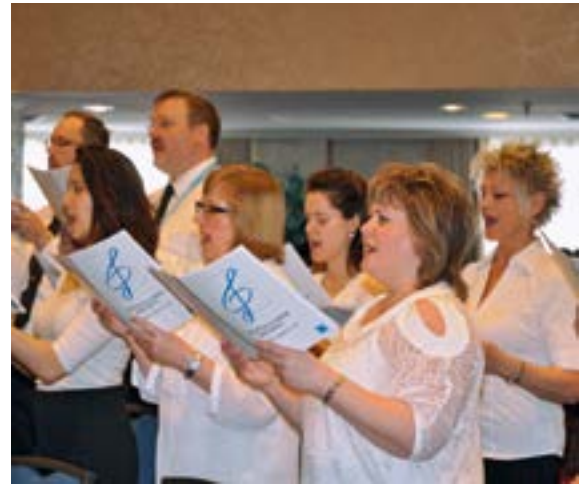
The divine service was transmitted to many of the 100 congregations in Canada.