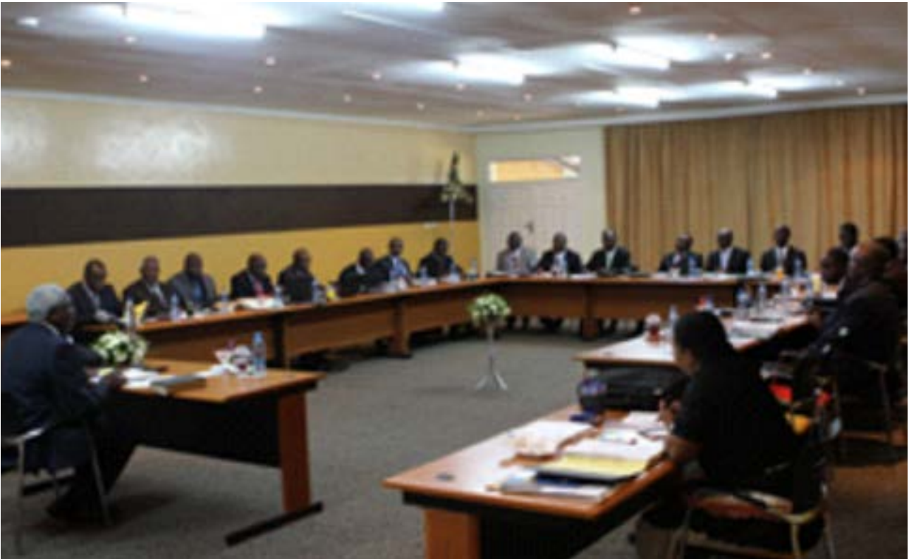
2017 National Council Meeting, Chisamba

Apostles of the New Apostolic Church in Zambia met at Chisamba's Protea Hotel for the 16th National Council Meeting on May 19, 2017.