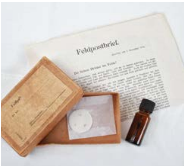
Below left: A letter to the frontlines containing a consecrated wafer, and a little bottle of wine Below right: Soldiers in the First World War lie in trenches during a break in the fighting