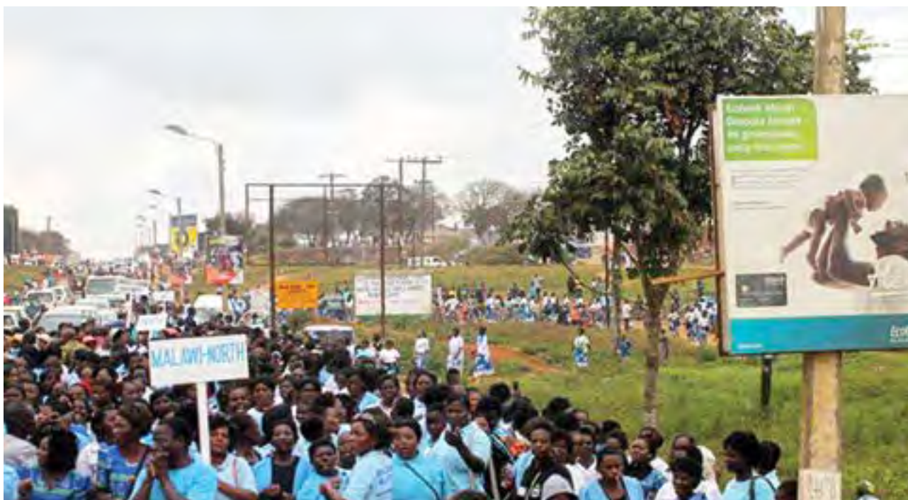
Sisters during the march past in Mzuzu