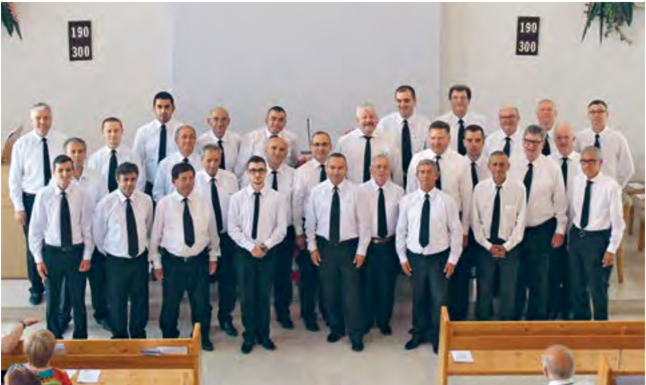
NAC North Rhine-Westphalia