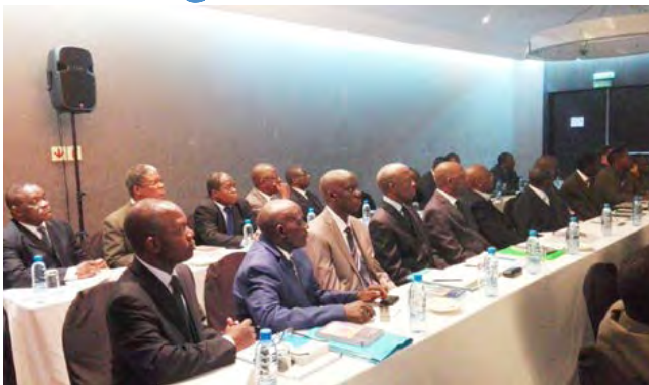
Part of the participants that attended theology training at Lusaka's InterContinental Hotel.

True to the motto “Educating the leaders” a new training programme has been initiated. This follows a decision by the Chief Apostle who stipulates that the Church leaders need more than firm faith and a good knowledge of the Bible.