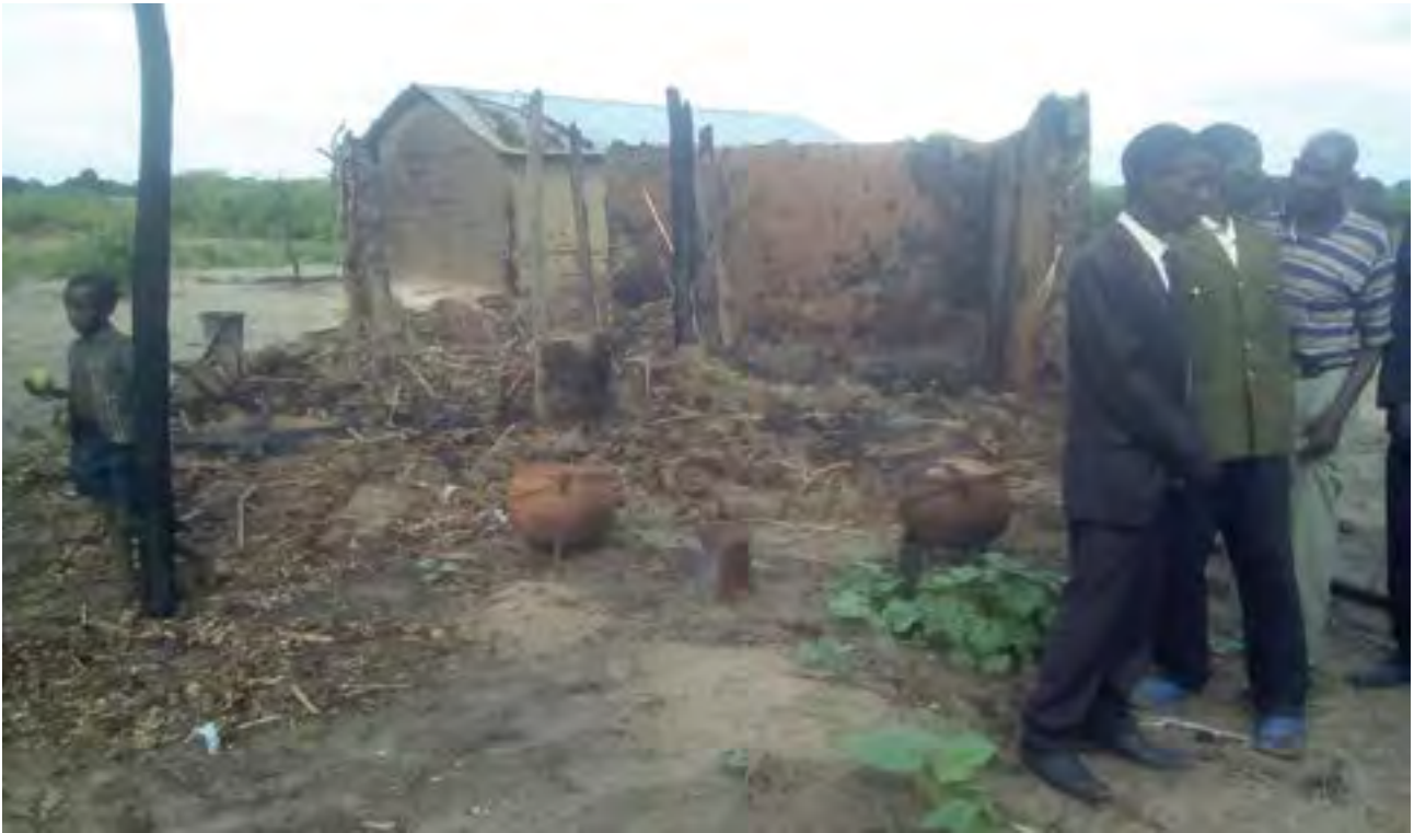
Part of the property that remained after fire gutted Ngomang'ulu village in Mitete on August 26, 2016