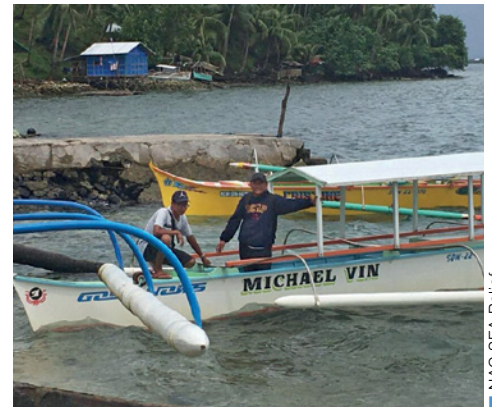
NAC SEA Relief