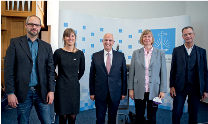
Representatives of the Council of Christian Churches in Germany