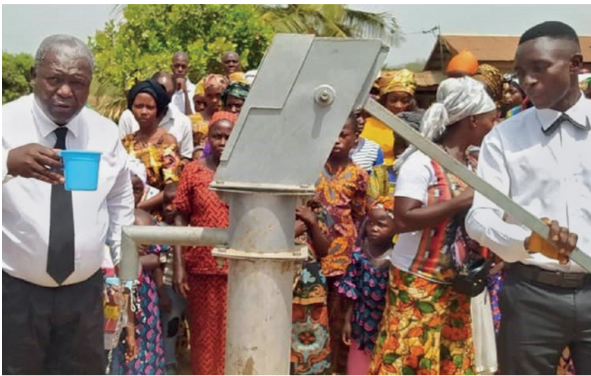
NAC Sierra Leone

...you see so many situations in which people need help. No matter if many or only a few look more closely, the help is gratefully accepted: in Ukraine, in Sierra Leone, and in the Philippines.