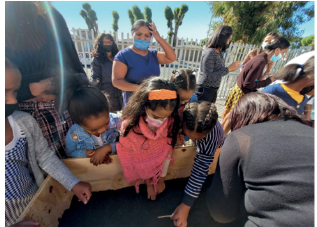
Children of the Woodlands congregation in Cape Town launch their planting project “My little garden”

The name of the initiative is “Music with Children. How to go about it after Covid?” Choir directors, as well as anyone who enjoys making music with children, can register on the online training portal of the New Apostolic Church Western Germany. During the training, participants will be made familiar with the teacher’s folder for the German children’s songbook Stimmt mit ein , will learn voice training stories, and how to make instruments themselves and then incorporate them. Music is an important aspect of religious education, supports personality development, and promotes fellowship.