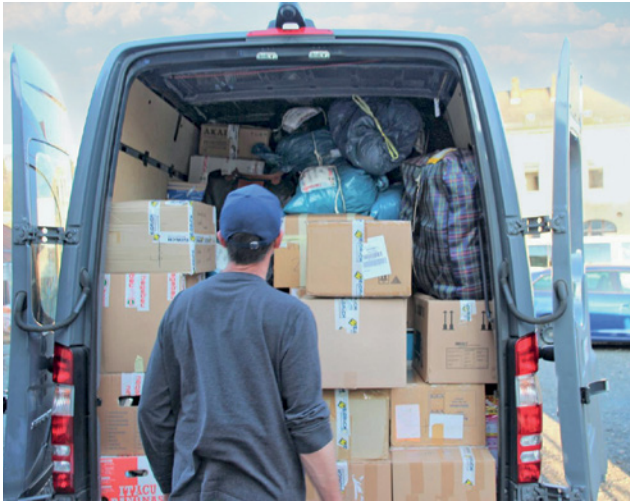
A van full of donations for Ukraine