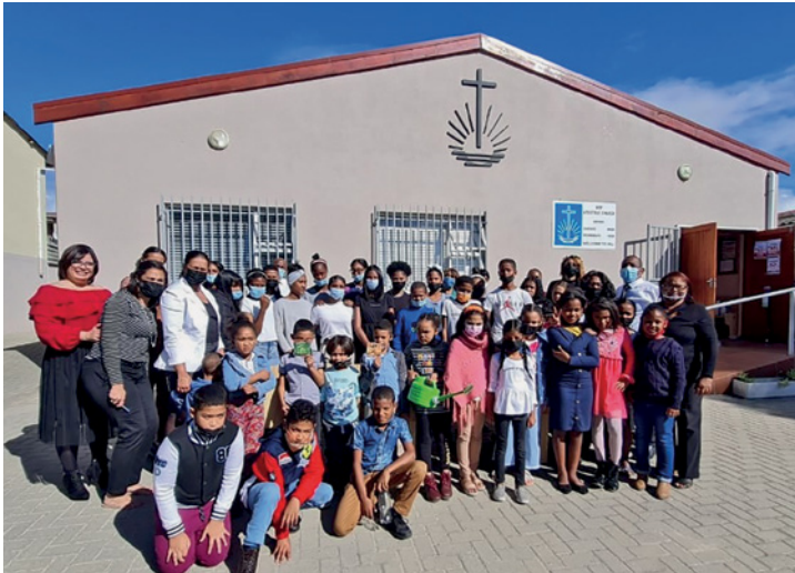
NAC Cape Town