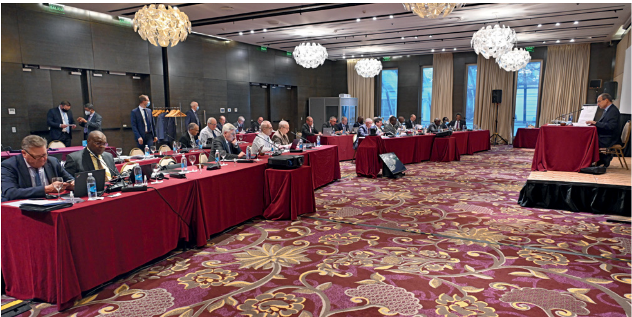
The District Apostles met in Buenos Aires over Pentecost for their semi-annual conference

“I am very grateful for this step,” he confessed after the vote. He said that it had been a concern of his for some time to share his leadership of the Church particularly in financial matters, which are linked to his ordination as Chief Apostle, with an elected board of directors.